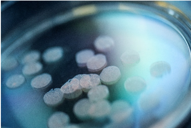
Picture 1: The lung slices the researchers use to study infections in human tissue are only about 500 µm thick.